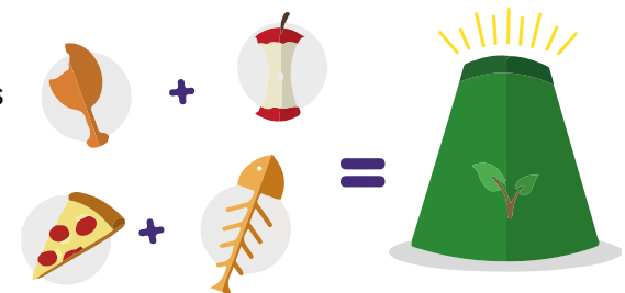
Green Cone - Food Waste Only

Alternatively, the Council has Green Cones available free of charge to residents. Green Cones are only a food waste digester, you cannot put green garden waste in them. The Green Cone does work in Orkney, but it may take longer than advertised owing to the climate.